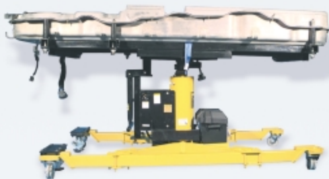
EVJ Large pack configuration

ETJ-TTJH Designed to lift 5 thru 13 speed transmissions with the same cradle as on our TTJ Lifting Systems